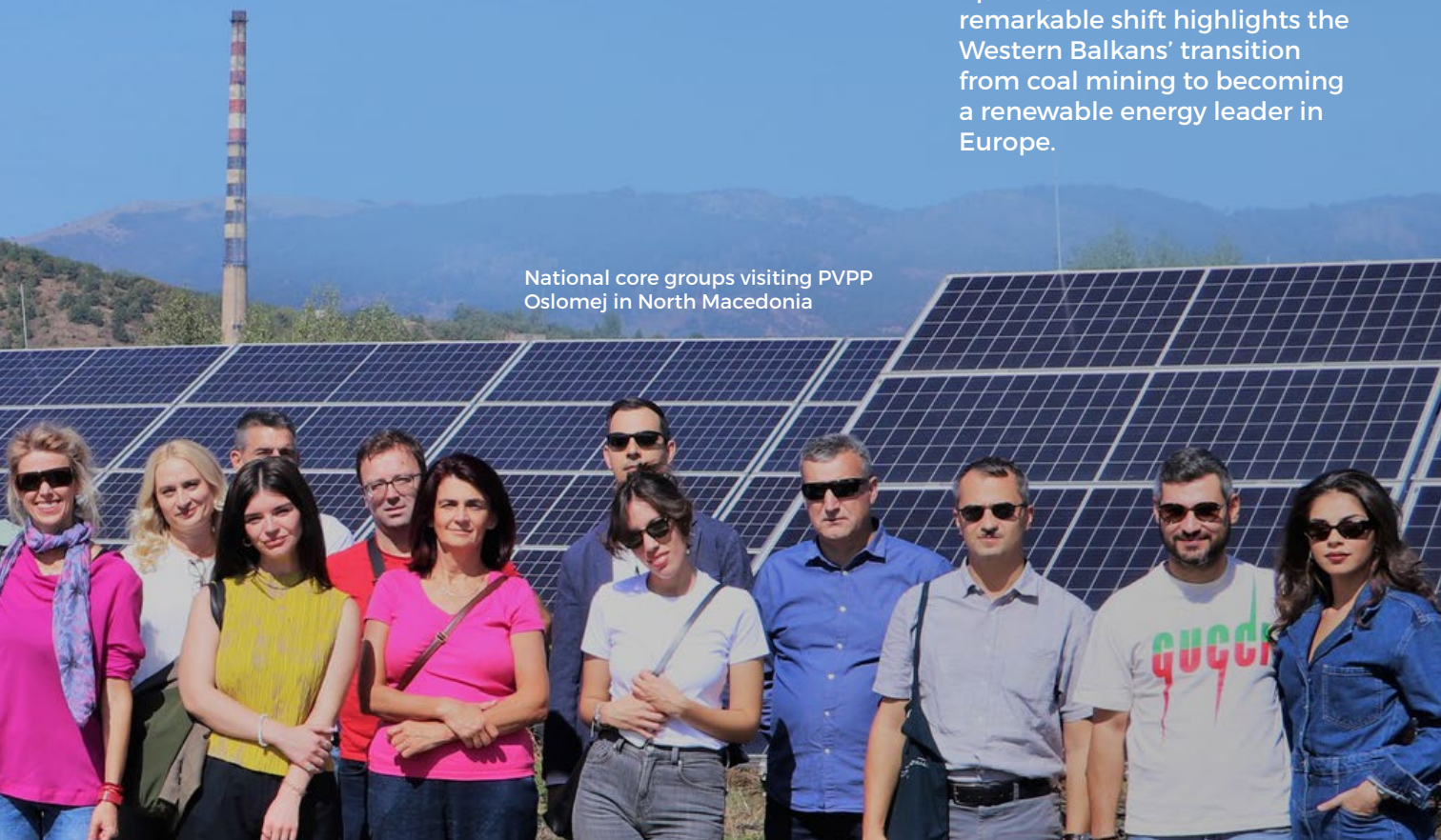
National core groups visiting PVPP Oslomej in North Macedonia

Our visit to North Macedonia aimed to witness the country's energy transformation firsthand. One striking example of the visit was Oslomej, a small village in Kicevo. Once a lignite mine since the 1980s, Oslomej is now a symbol of renewable energy. By 2030, mining will completely stop, replaced by solar panels that already provide enough electricity for up to 5,000 households. This remarkable shift highlights the Western Balkans' transition from coal mining to becoming a renewable energy leader in Europe.